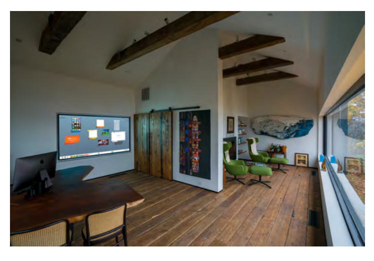
The open space designed for work and peaceful reflection

experience to enjoy TIDAL and other streaming content along with an array of favorite podcasts.