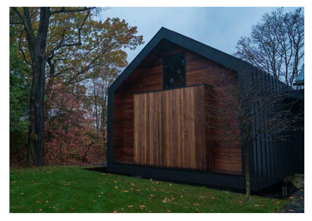
Upstate New York barn with views of the Hudson River

The T1V collaboration software supports BYOD™ (bring your own device) to support the many devices, programs, and platforms