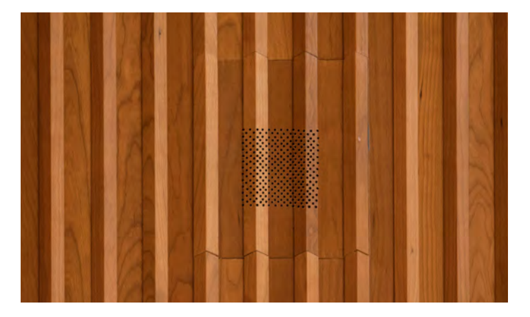
James Loudspeaker Small Aperture 63SA-7HO 3-way speakers reside inside the walls

One of the challenges that the technicians faced when integrating the audio system was to get sound from the speakers into the space through the beautiful fruitwood composite (Cherry and Pear) that was used throughout the interior. Though James