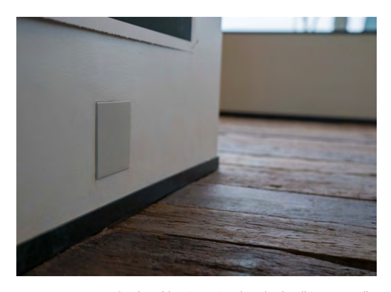
Barely visible—James Loudspeaker Small Aperture grilles

Because this client desired audiophile quality driving bass response in this environment, the Gilmore team integrated a single 101SA-6 subwoofer behind the wallboard in each zone. The 101SA-6 features an all-aluminum bandpass enclosure housing a 10-inch woofer mated to an elegant, compact 4-inch grille. Each subwoofer is driven by a James Loudspeaker M1000 amplifier nestled in a rack within the concealed, dedicated and air-cooled equipment space next to the yoga studio. The rack also contains the networking hardware, streaming music servers and multi-channel amplifiers for the entire system.