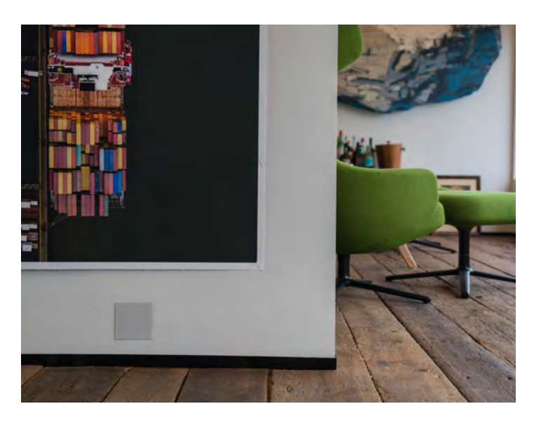
Barely visible—James Loudspeaker Small Aperture grilles