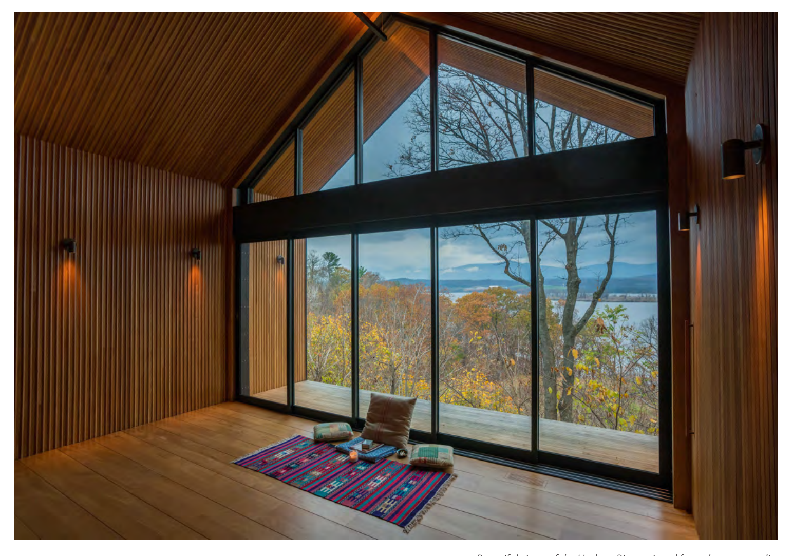
Beautiful views of the Hudson River enjoyed from the yoga studio