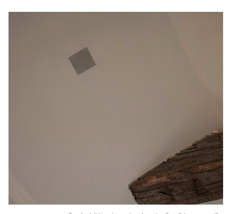
Barely visible—James Loudspeaker Small Aperture grilles

There are three primary zones of entertainment within the renovated barn; the yoga room, the office and a sitting area. There is also music available in the steam room as well. In order to achieve the output levels, detail and balance that the client desired, the team from Gilmore deployed James Loudspeaker 63SA-7HO Small Aperture® architectural speakers (two pair in the office, two pair in the yoga studio and a single pair in the sitting room) and a 101SA-6 Small Aperture architectural subwoofer in each zone. The award-winning 63SA-7HO is a true full range, 3-way design with a 0.75-inch (19mm) aluminum dome tweeter, 2-inch (50mm) aluminum midrange driver and a 6.5-inch (165mm) aluminum woofer, all concentrically mounted within an aircraftgrade aluminum enclosure. Inherently durable and designed for multi-zone audio installations, the 63SA-7HO is especially suited for premium installations where critical listening is paramount and aesthetics are equally as vital. The point source mid/high module provides excellent off-axis response and the overload-protected hidden woofer generates bass down to 38Hz for a truly full-range music experience—and all from a beautiful 3-inch round or square Microperf grille.